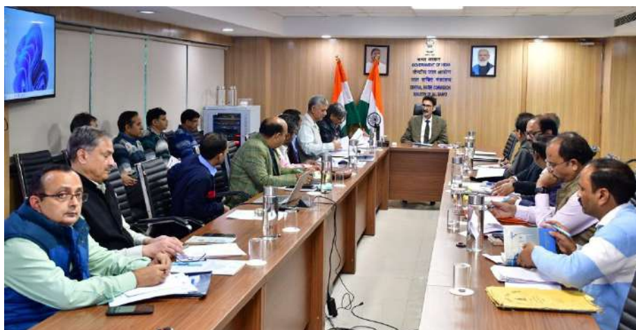
3 rd meeting of the Committee constituted under the Chairmanship of the Chairman, CWC to study the basis and logic of the allocation of Yamuna water up to Okhla to the erstwhile State of UP and recommend the allocation to the States of Uttarakhand and Uttar Pradesh in the share of erstwhile State of UP held on 29.11.2023

Two meetings of the Committee constituted under the Chairmanship of the Chairman, CWC to study the basis and logic of the allocation of Yamuna water up to Okhla to the erstwhile State of UP and recommend the allocation to the States of Uttarakhand and Uttar Pradesh in the share of erstwhile State of UP was organised during the year. After extensive deliberations, a consensus has been achieved among the two States on water allocation during its meeting held on 29.11.2023. The report of the Committee was prepared and sent to Ministry on 14.2.2024.