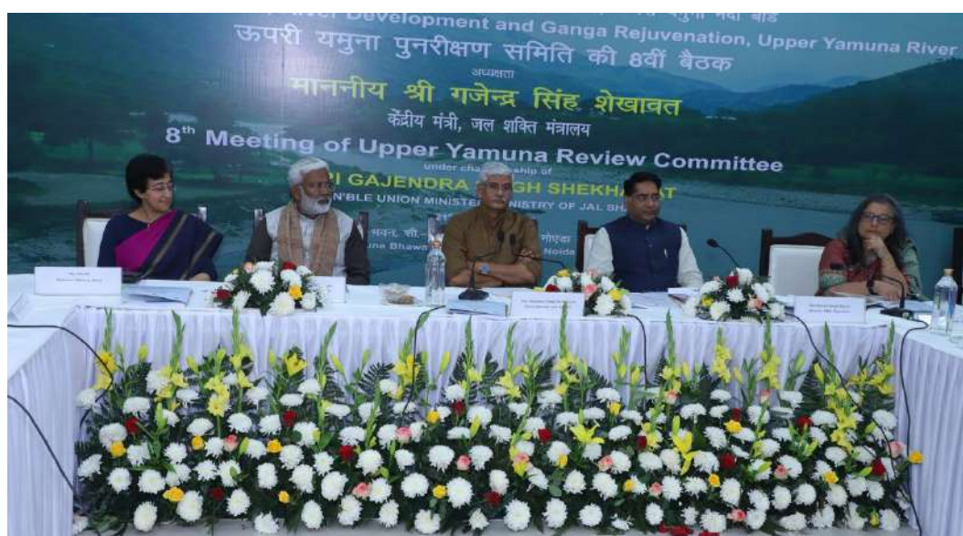
8th meeting of Upper Yamuna Review Committee (UYRC) held under the chairmanship of Shri Gajendra Singh Shekhawat, Hon'ble Union Minister for Jal Shakti on 21.2.2024 at Yamuna Bhawan, Noida