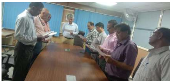
Integrity Pledge on 30.10.2023