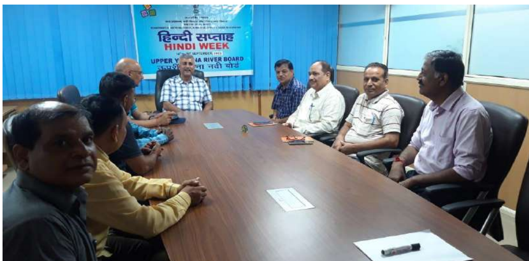
Discussion on improving use of Hindi in Office on 21.9.2023