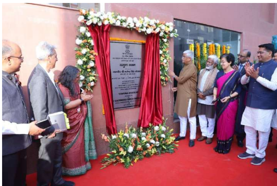
Inauguration of UYRB building by Shri Gajendra Singh Shekhawat, Hon’ble Union Minister for Jal Shakti on 21.2.2024

The construction work for the office building of UYRB “Yamuna Bhawan” was completed and its completion certificate was issued by Noida Authority on 3.2.2024. The inauguration of building was done by Shri Gajendra Singh Shekhawat, Hon’ble Union Minister for Jal Shakti on 21.2.2024. The Secretariat of the UYRB has started functioning from its new office building.