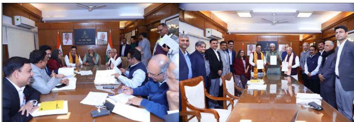
Signing of MoU on 17.2.2024 for preparation of DPR jointly by the Governments of Haryana and Rajasthan for project for transfer of water through underground pipelines

17.2.2024 which has paved way for stepping forward for ending almost two decade old issue for transfer of Yamuna water to Rajasthan.